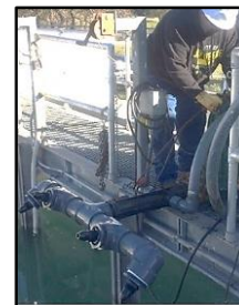
Optional Distribution Manifold