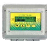
HYPO TRAK For sodium hypo- chlorite. Bulletin 516

The Electronic Chem-Scale can be ordered with the Wizard 4000, SOLO G2 or HYPO TRAK Digital Weight Indicator for a complete monitoring system.