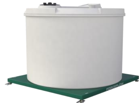
High Accuracy 4-Load Cell Model