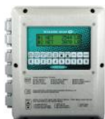
WIZARD 4000 (1 TO 4 CHANNEL) Bulletin 400