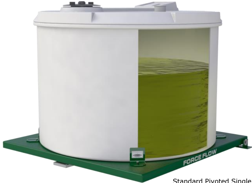
Standard Pivoted Single Load Cell Model

Using a scale is the most accurate method available for monitoring chemical inventory and the proven design of the Electronic Chem-Scale insures that your monitoring ability will be available day in and day out.