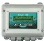
SOLO G2 (1 OR 2 CHANNEL) Bulletin 516